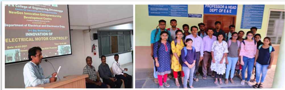
Workshop on "Innovation of Electrical Motor Controls"