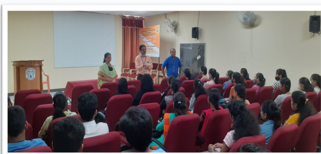
Non-Paced Training Program