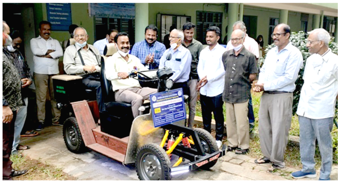
Quadbike Designed & Developed by Final Year Students