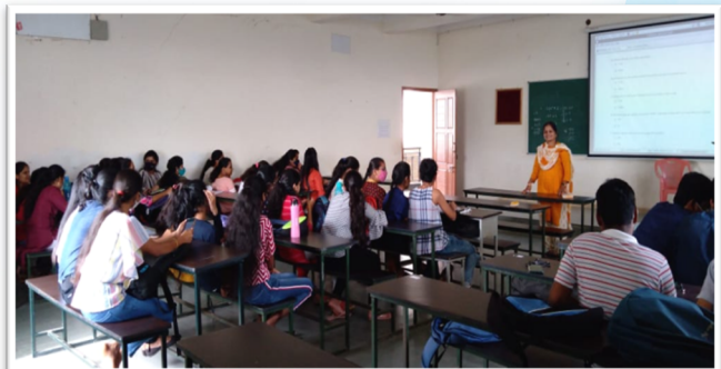
Two Days Student Development Program on "C Programming Skills" on 20th & 21st September 2021.