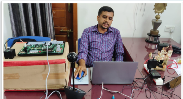
Student Development Program on "Application Development using ARM & ATmega Microcontrollers" on 06/08/2021