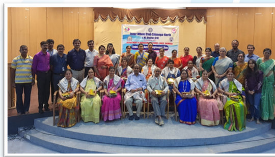
Celebration of Teachers Day and Engineers Day by Inner Wheel Shimoga-North in association with Department of Management Studies, JNNCE Shivamogga on 30/09/2021.