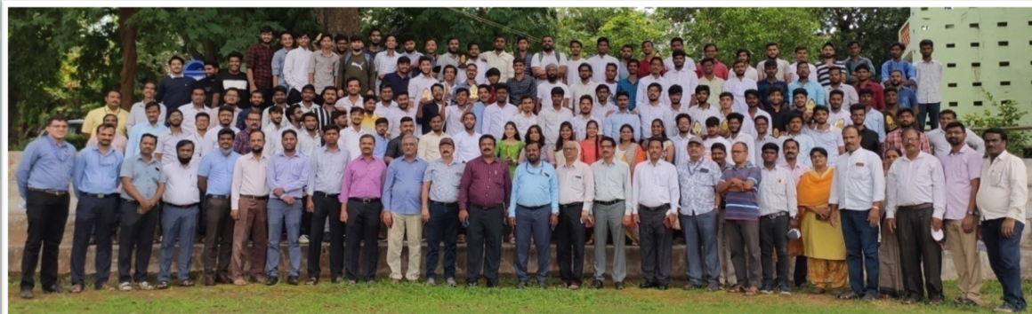
Final Year Passing Out Students along with Faculty & Staff of Department