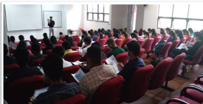
A Three days Placement training was organized by the Department on the topic of "Quantitative Aptitude Skills"