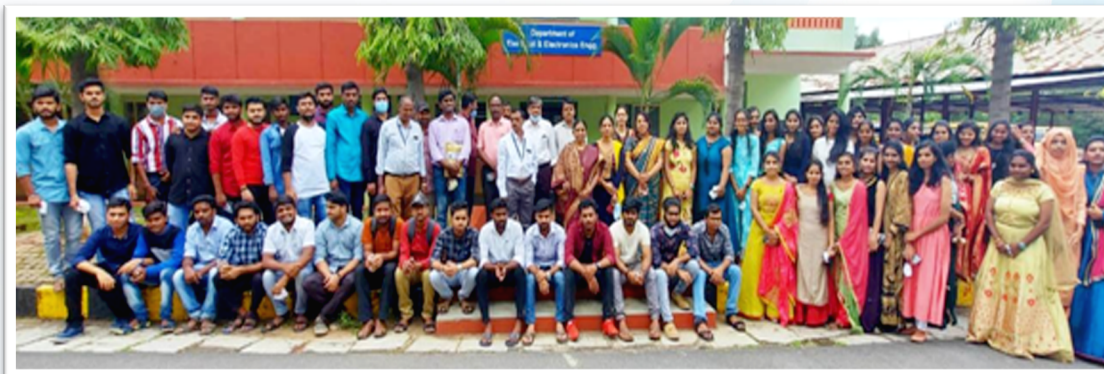
Final year B.E in Electrical and Electronics Engg., 2021 Batch output.

The final year EEE students received 36 placement offers, in reputed Companies, like TCS, Accenture, Elcamino Software, X-WORKZ ODC, Technologies Global Pvt. Ltd., Pentagon Space Pvt. Ltd., with a good salary package. The Pre-final year EEE students received 02 placement offers, so far.