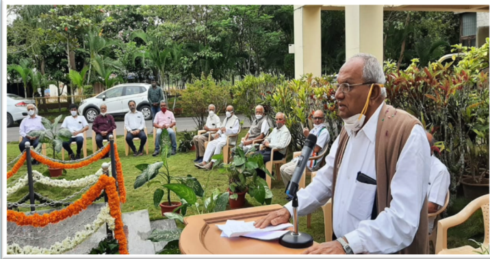
Celebrated Independence Day on 15th August 2021 at JNNCE Campus