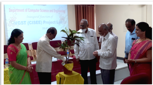
Inauguration of VGST (CISEE) Project Lab