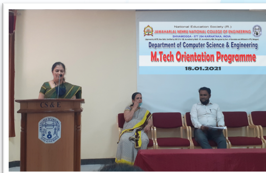
M. Tech Orientation Program