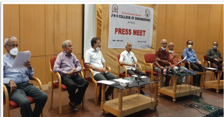
Conducted Press meet at JNNCE MBA block on progress of the institution and about new branch of Artificial intelligence & Machine learning On 08.07.2021