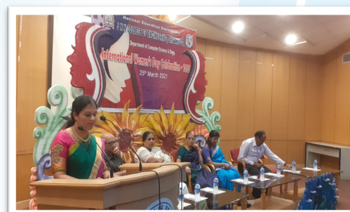
International Women's Day Celebration 2021 Conducted by Department of CS&E