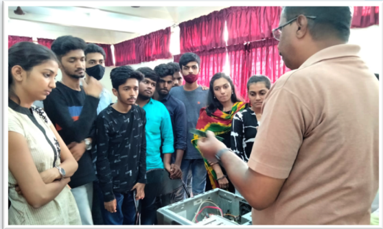
A demonstration session on "Hardware Parts" for 1st Semester students on 17/03/2021 & 23/04/2021