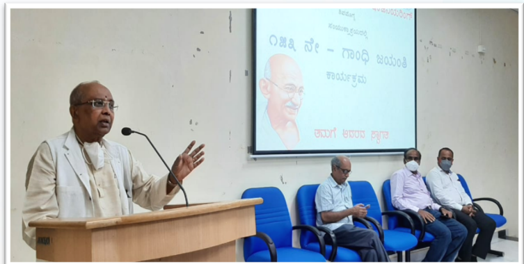
Celebrated Gandhi Jayanthi on 2nd October 2021 at JNNCE Campus