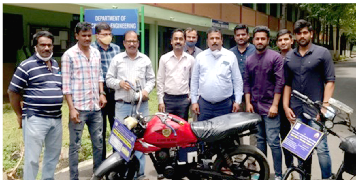
EV Bike & Scooter Designed & Developed by Final Years Students