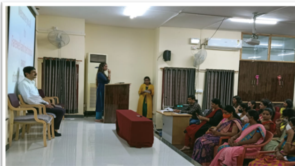
Farewell function for Final year students was arranged in the Department on 31st July 2021