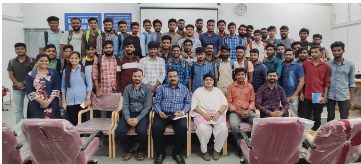
Final Year Student Internees of Tata Power Skill Development Institute conducted at JNNCE on Aug 2021