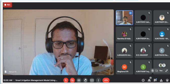
An online webinar on the topic "Smart Irrigation management model using Intelligent Internet of things" on 1st July 2021