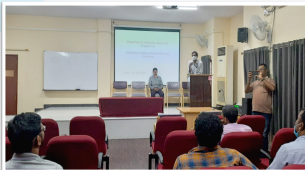
One day workshop on "Campus Network Maintenance to the Non-Teaching Staff of JNNCE on 25/08/2021